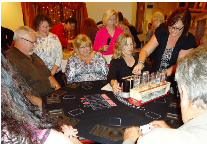
Celebrate the West 2014 opened the evening with a rousing poker hand for the Texas Holdem Poker Set. The winner is not visible but accepted the win with grace.

Grace is God’s unmerited favor; grace is God doing good for us that we do not deserve! “Grace is a room of a thousand mirrors, all reflecting the face of Christ” (Beth Moore).