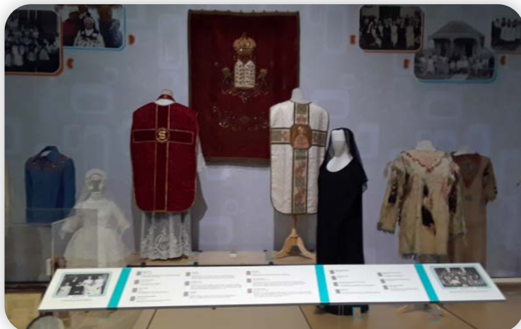
A larger view of the display containing the Benedictine sister.