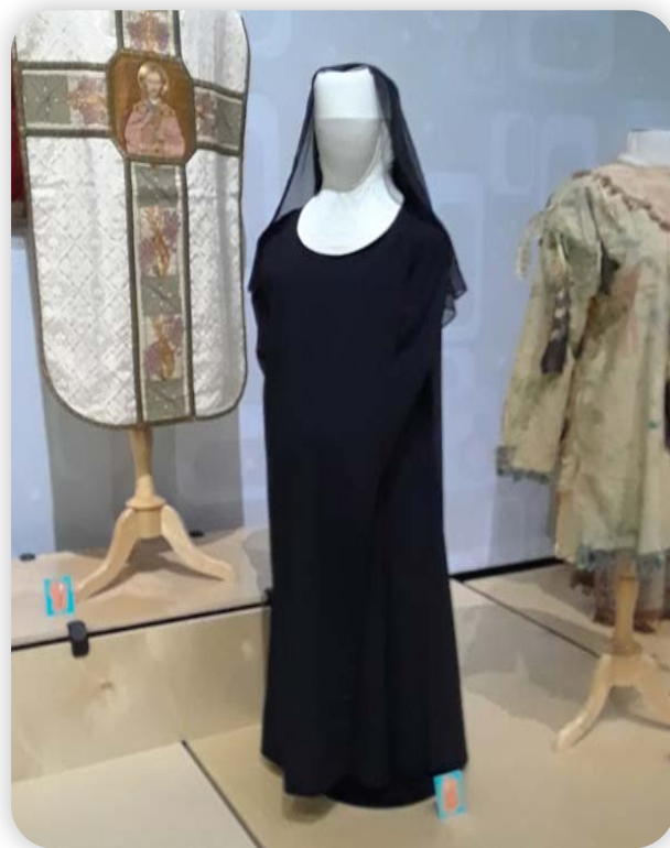
The Benedictine sister is part of the religious story section of the display. Our Monastery donated her coif.