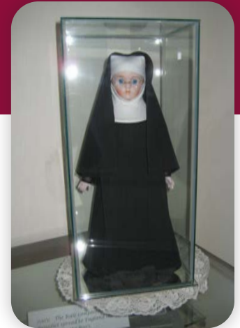
Another donation on display from our Monastery is this nun doll. Some of you may recognize it from our Adopt-a-Nun program.