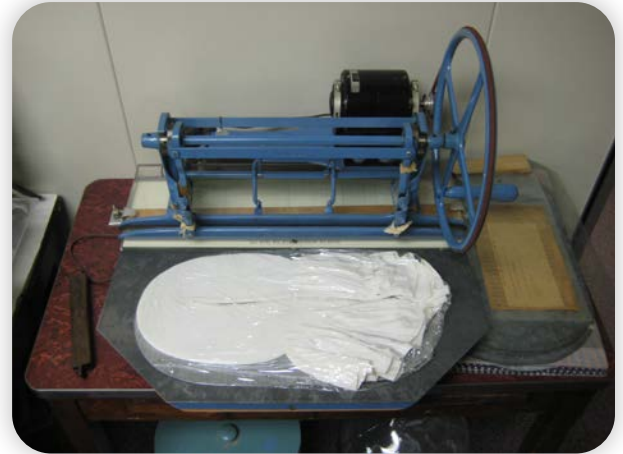
Our Monastery donated the coif machine and the coif seen in this picture.

Among the artifacts we donated to the museum were our two coif machines and a couple coifs. We are grateful the coifs will be stored in a climate-controlled place, as no one makes coifs anymore. Thus, the public will be able to view our coifs and the pleats will remain intact. The staff were intrigued by the story of the coif and how the coifs were made.